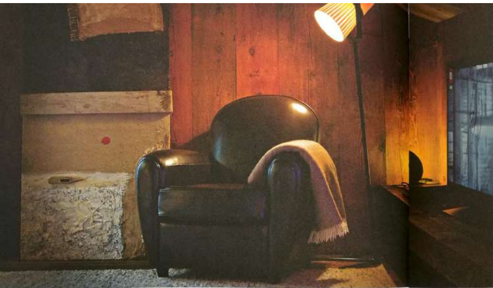
Wood design in a warm and original character.